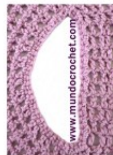
Detail of the armholes's edge