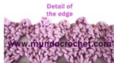
Detail of the edge